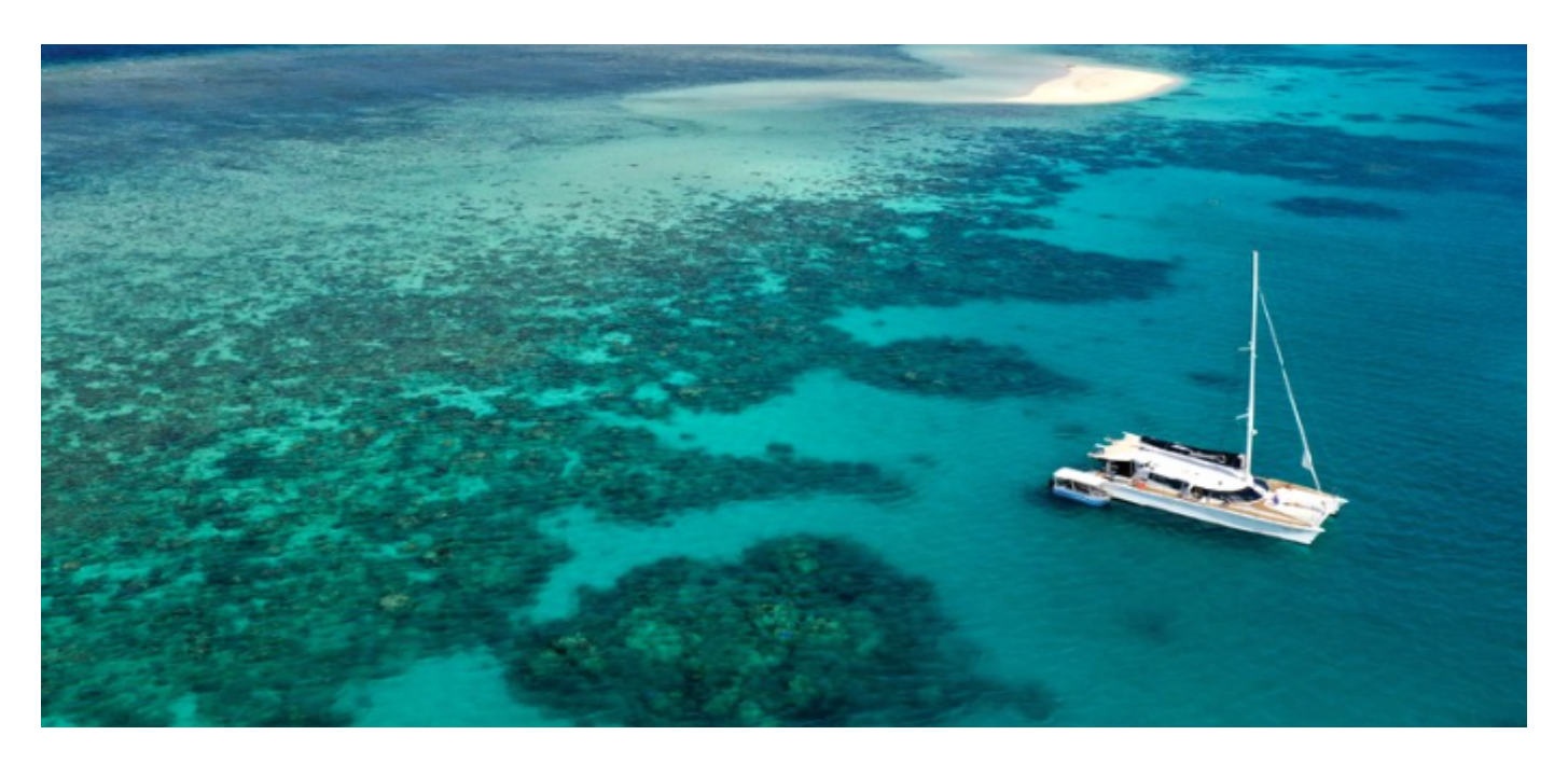
Tuesday, 22 April 2025

Walkabout Cultural Adventures - Morning Private Ngana Julaymba Dungay (Daintree) Includes: Hotel pick up and drop off, Professional Aboriginal Guide, Bush Tucker Tasting (seasonal & tidal), morning tea.