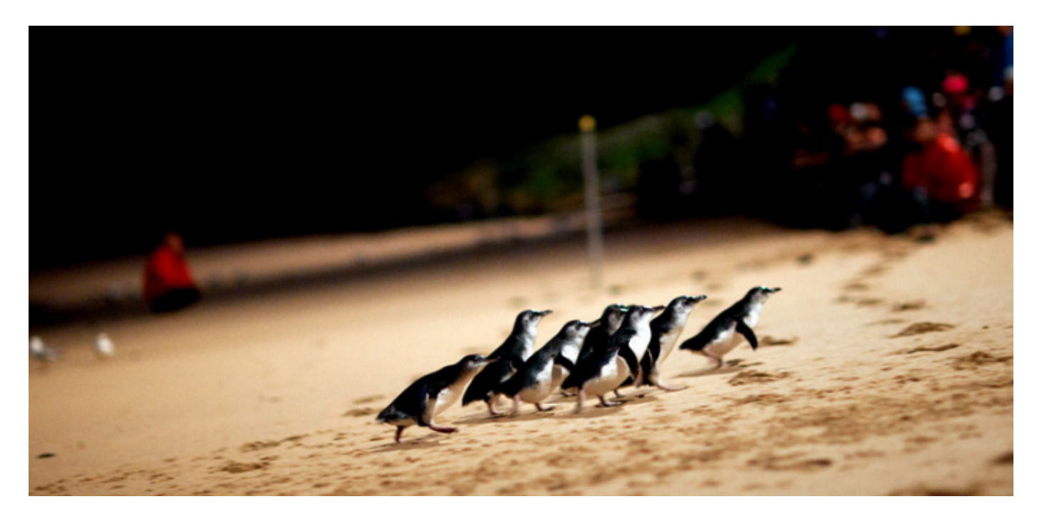
Tuesday, 15 April 2025